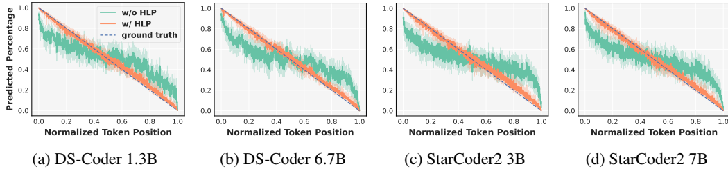
Figure 4: Predicted percentage of remaining future tokens (as defined in Eq. (3)) from models trained w/o and w/ HLP at different token positions, where the concrete position of each token is normalized to the corresponding percentage over the whole sequence.